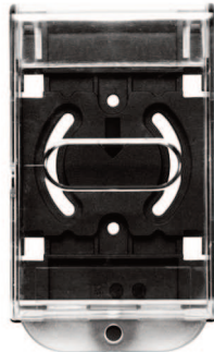
LIBERO GE Bracket Durable transparent two-part case for mounting of all LIBERO Gx and ECOLOG-PRO xG devices