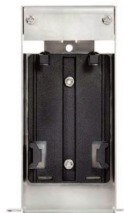
LIBERO CE Stainless Steel Bracket For connection of external probes with terminals for PT100 (3-wire) for LIBERO

NOTE: For calibration certificate standard tolerances, see Section 3.1 of the ELPRO GLOBAL SERVICE DESCRIPTION