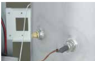
Standard equipped with 2 sensor ports on the main unit