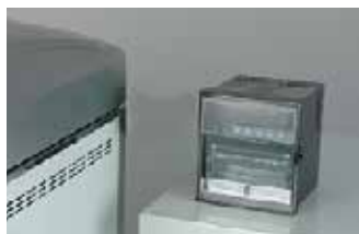
Optional chart recorder